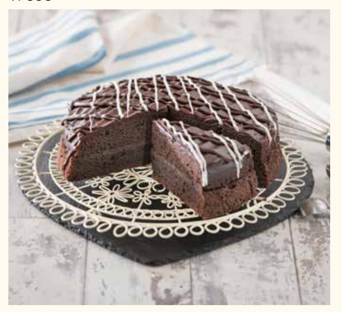
A rich chocolate flavoured sponge, filled and finished with smooth chocolatey icing , decorated with zigs and zags of dark chocolate and white icing