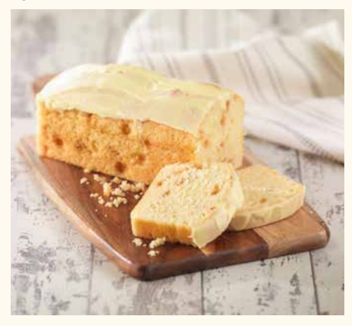
A light zesty lemon flavour sponge loaded with lemon fruit pieces and finished with a lemon flavoured icing