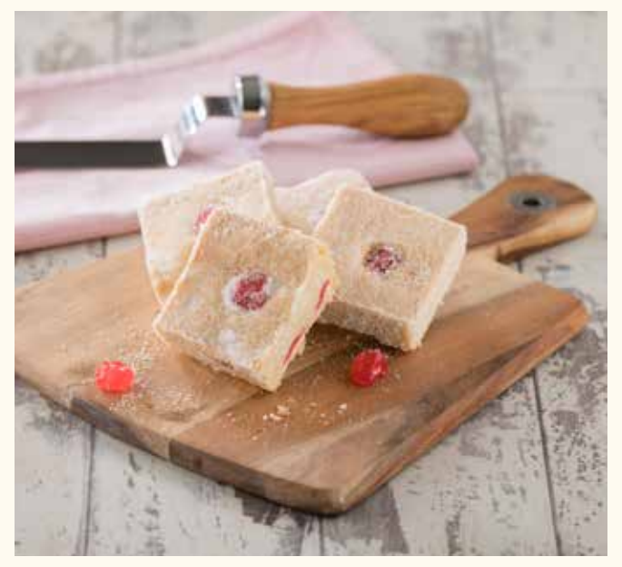
A sweet and crumbly butter shortbread laced with plump juicy candied red cherries, cut into 15 squares, single tray in sleeve.