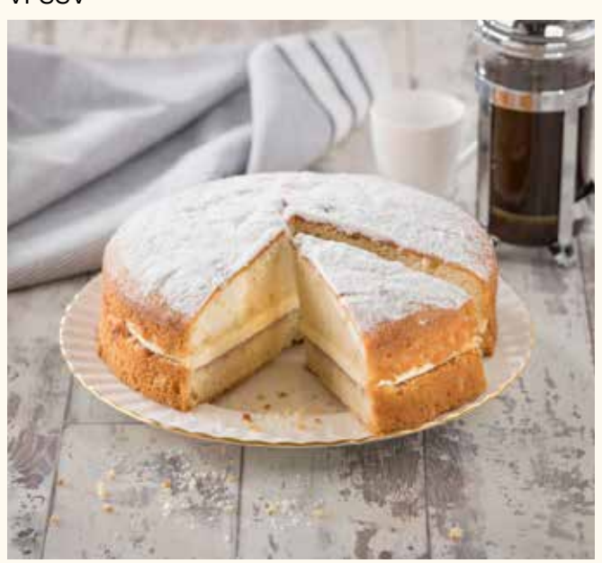
A light vanilla flavoured sponge, filled with fruity raspberry jam, and a layer of sweet vanilla flavoured icing, finished with a light sugar dusting.