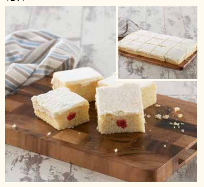
A light vanilla flavoured sponge baked with seedless raspberry jam and finished with vanilla flavoured icing and a light sugar dusting, cut into 15 squares, packed two trays per box.