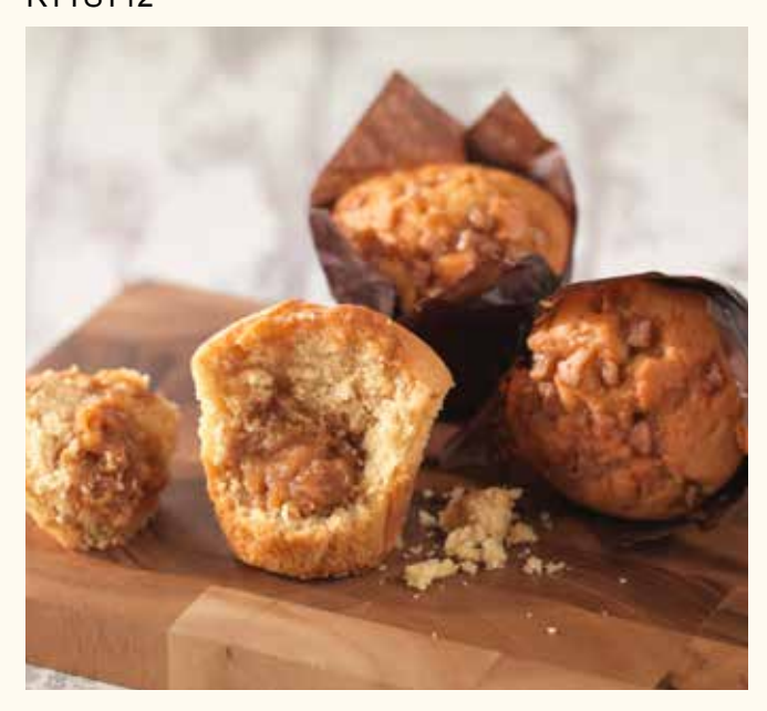
A toffee flavoured muffin made with caramel fudge pieces and filled with toffee filling,, individually flow wrapped, 12 muffins per box \,

Shelf Life: 28 days ambient, 12 months frozen (once defrosted, eat within 5 days)