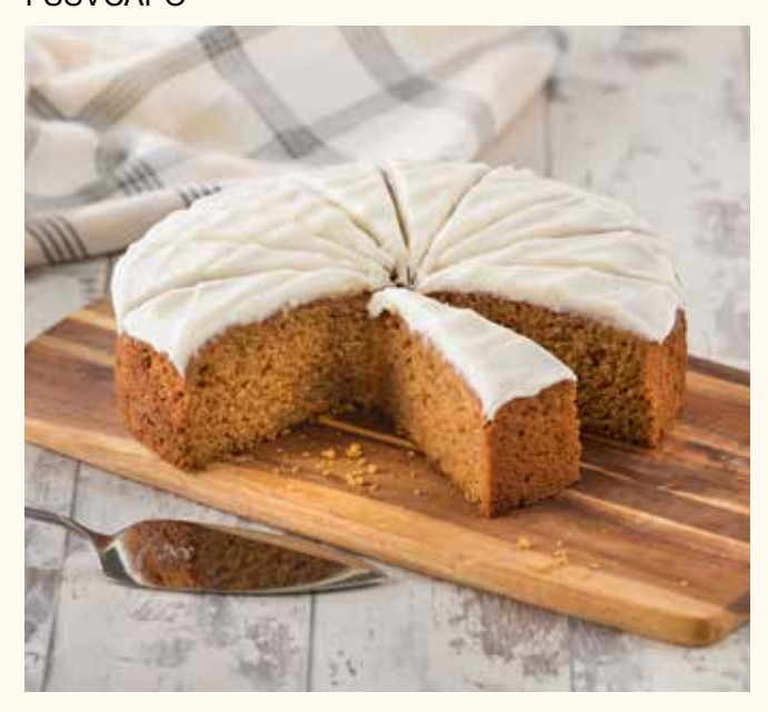
A rich carrot cake made with grated carrot and topped with cream cheese icing.