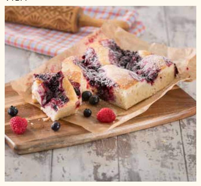
A light vanilla flavoured sponge traycake, enriched with a vibrant fruits of the forest filling baked in, decorated with a dusting of fine sugar.