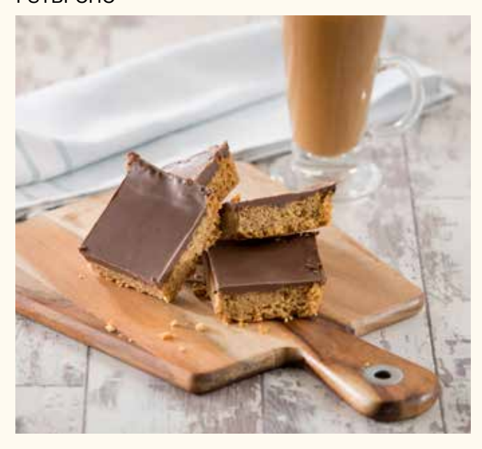
Traditional rich buttery flapjack with jumbo oats, finished with a layer of chocolate flavoured topping, cut into 15 squares, 4 trays per box