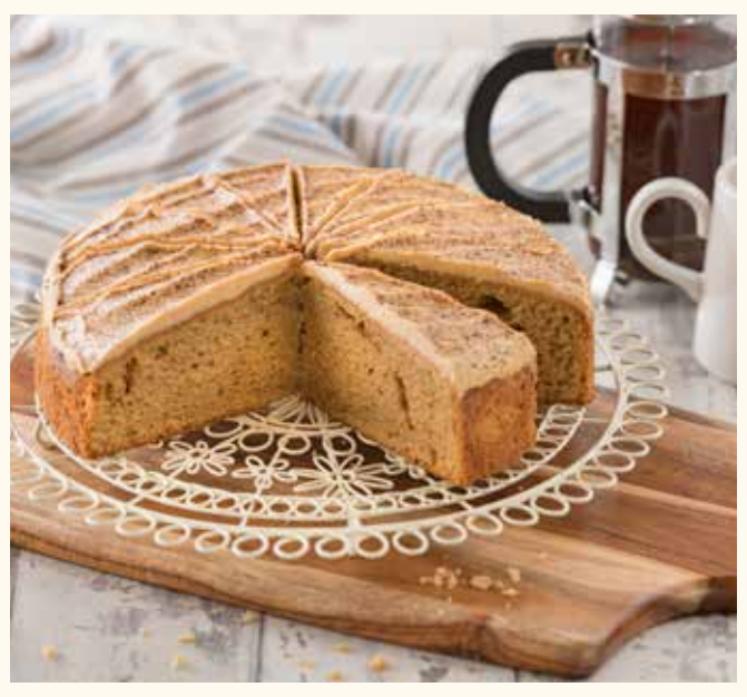
A coffee infused sponge, finished with a coffee flavoured icing