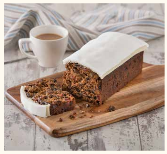
A rich moist sponge flavoured with cinnamon, mixed spice and orange, loaded with juicy plump sultanas, raisins, citrus candied peel and red candied cherries, and brandy, apricot jam spread evenly over the top of the cake, then topped with of a layer of white almond paste and finished with a layer of white icing on top.