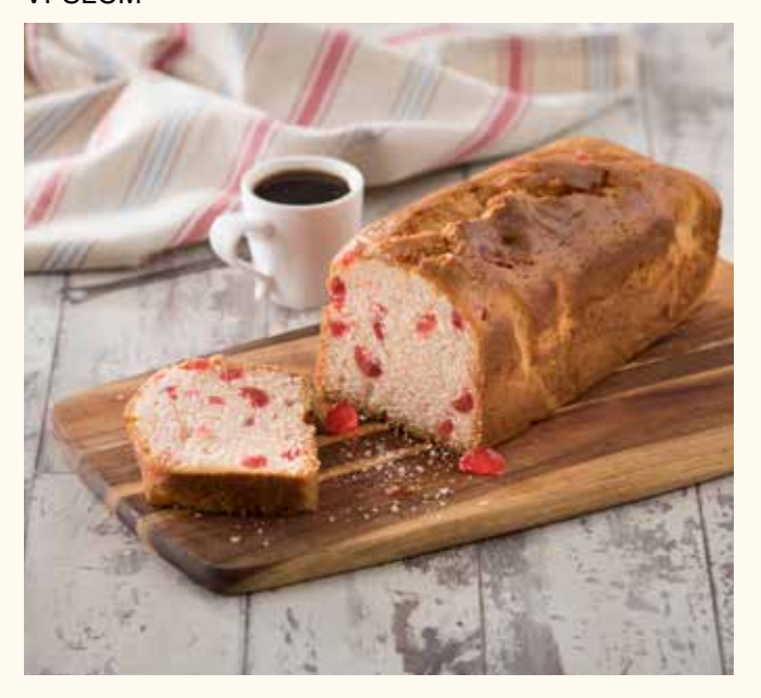
A light vanilla flavoured madeira sponge loaded with red candied cherries, baked in a loaf tin, perfect for slicing.