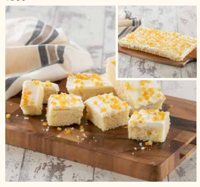
A moist orange flavour sponge, finished with a smooth lemon cream, decorated with tiny pieces of candied orange and lemon peel, cut into 12 rectangles, single tray in sleeve