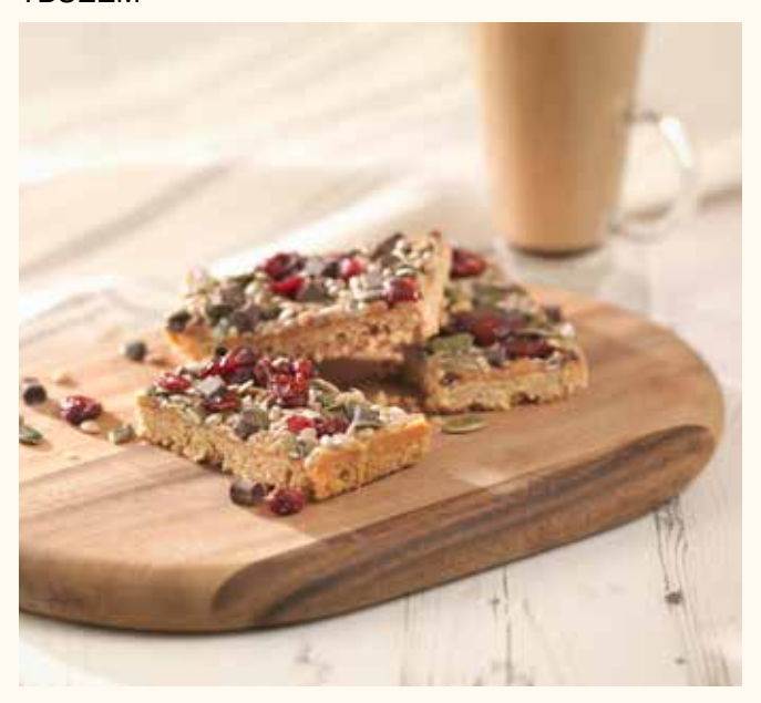
A flapjack base with a layer of rich caramel, finished with seeds, fruit and chocolate chips, cut into 12 rectangles, single tray in sleeve.