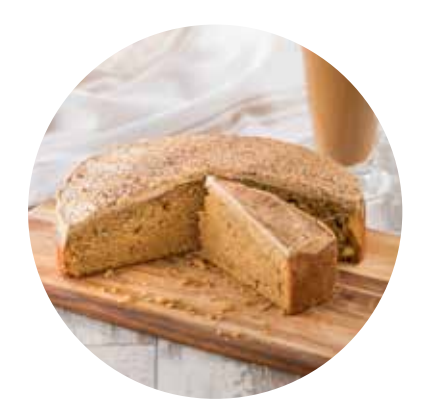
A coffee infused sponge, finished with a coffee flavoured icing