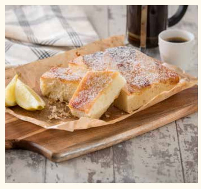
A light and sweet lemon flavoured sponge traycake, enriched with a tangy lemon curd baked in, decorated with a dusting of fine sugar.