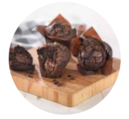
Double Chocolate Tulip Muffin RTTDCH12

A rich chocolate flavour muffin with indulgent chocolate chunks, injected with a chocolate flavour sauce, individually flow wrapped,12 muffins per box.