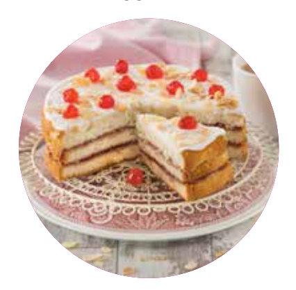
Bakewell Gateaux FSSEBW

A Genoise sponge delicately flavoured with almond, filled with fruity raspberry jam, finished with white icing, decorated with red candied cherries and flaked almonds.