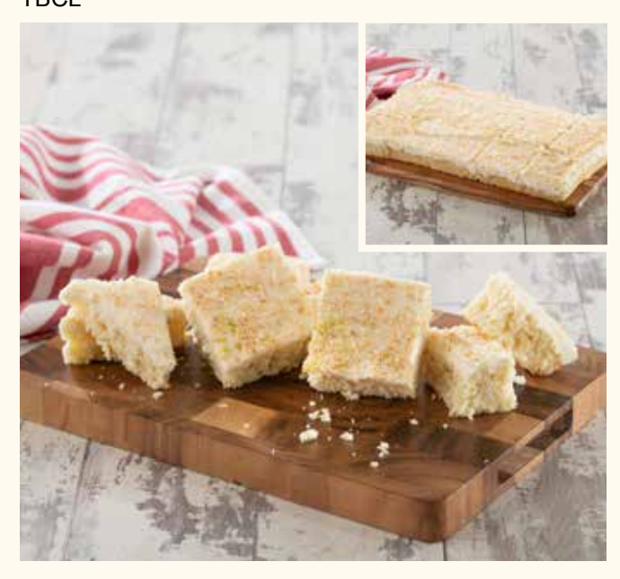
A light sponge made with coconut and lime zest, finished with a lime & cream cheese flavoured icing, sprinkled with toasted coconut and lime zest, cut into 15 squares, single tray in sleeve.