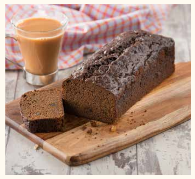
A moist sticky sponge blended with spices and loaded with diced stem ginger.