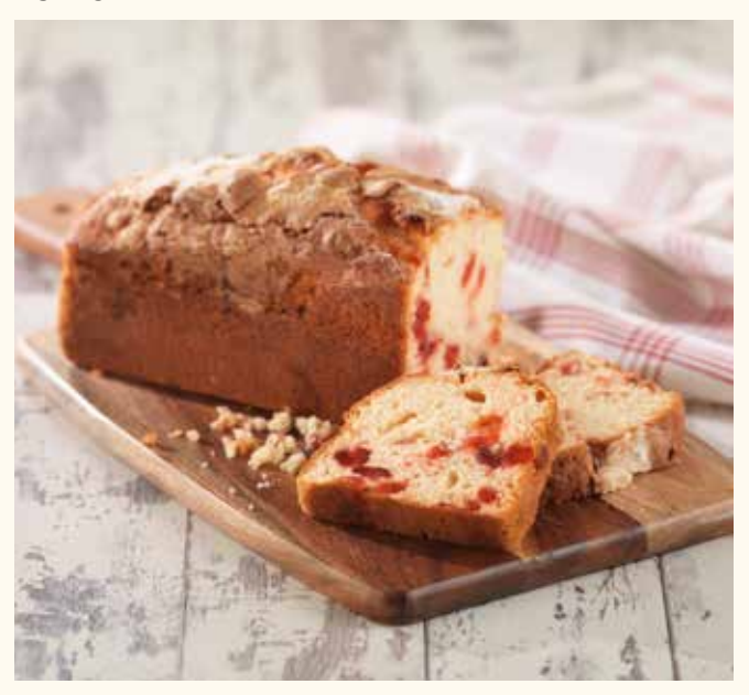
A moist buttery vanilla sponge loaded with plump juicy red candied cherries.