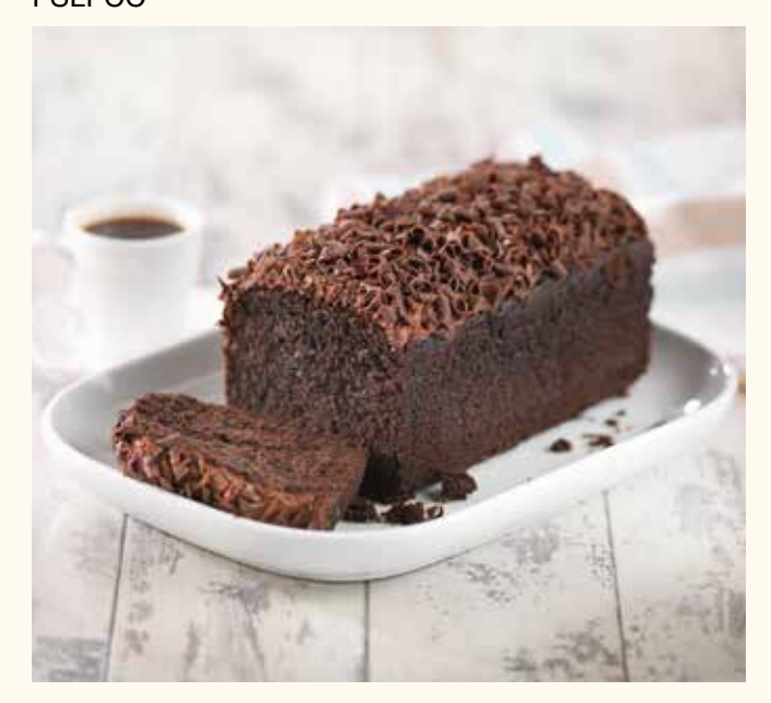
A rich chocolate loaf loaded with chocolate chips, finished with a luxurious chocolate flavour icing and milk chocolate curls.