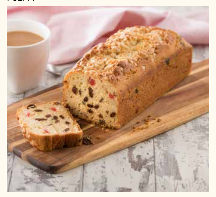
A moist and light sponge loaded with juicy plump sultanas and red candied cherries.