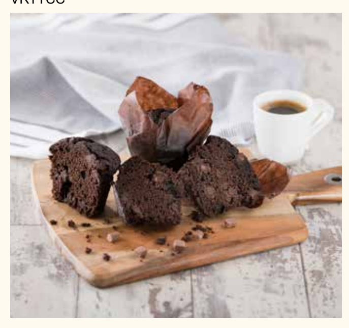
A rich indulgent chocolate flavoured muffin loaded with vegan dark chocolate chunks.