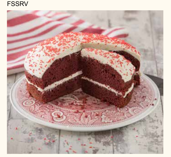
A dark red colour sponge filled and finished with rich vanilla cream, decorated with red sugar strands.