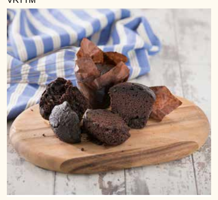
A rich indulgent chocolate flavoured muffin.