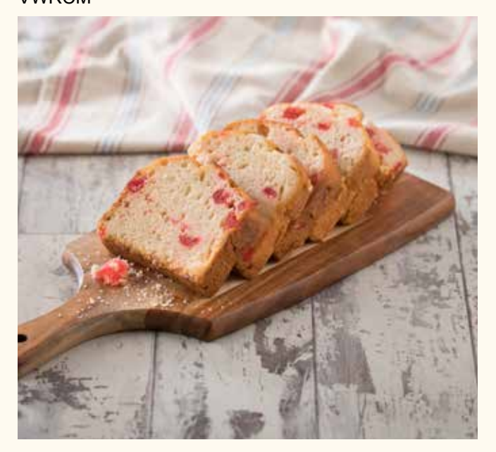
A light vanilla flavoured madeira sponge loaded with red candied cherries, baked in a loaf tin, sliced and individually wrapped. Perfect for Grab and Go, Eat on the Move