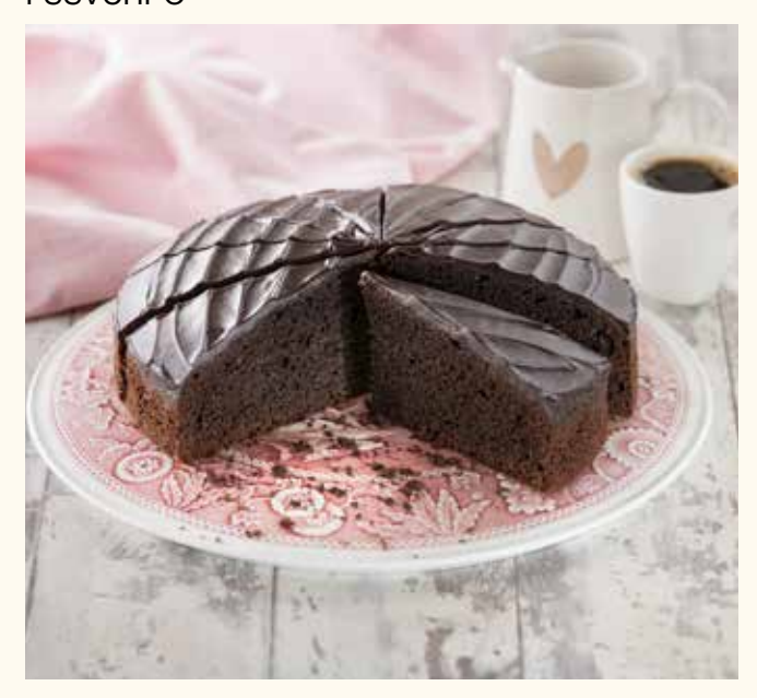
A luxurious chocolate cake, filled and coated with an indulgent and thick chocolate fudge icing.