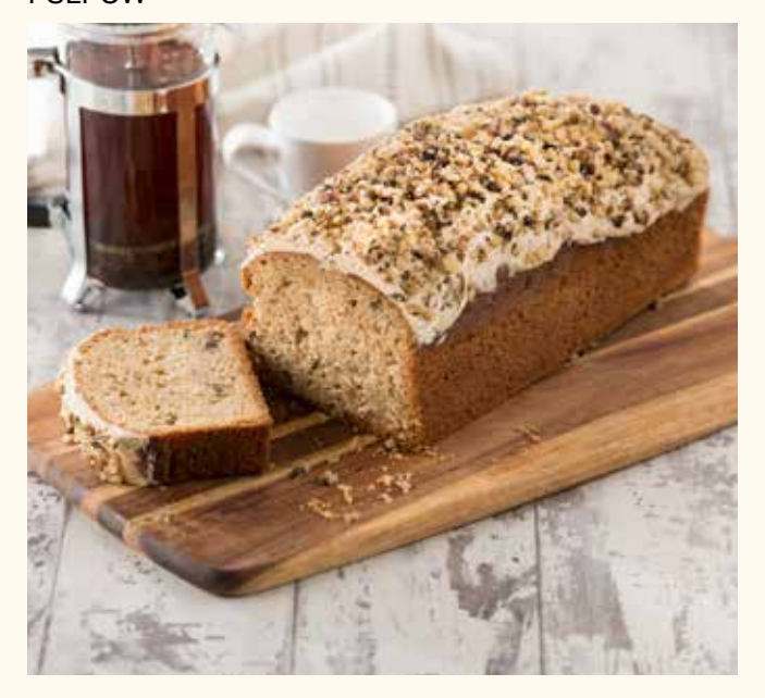
A moist coffee infused sponge, finished with a rich coffee flavoured icing and chopped walnut pieces.