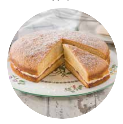
A light vanilla flavoured sponge, filled with raspberry jam and vanilla buttercream, finished with a light dusting of fine sugar.