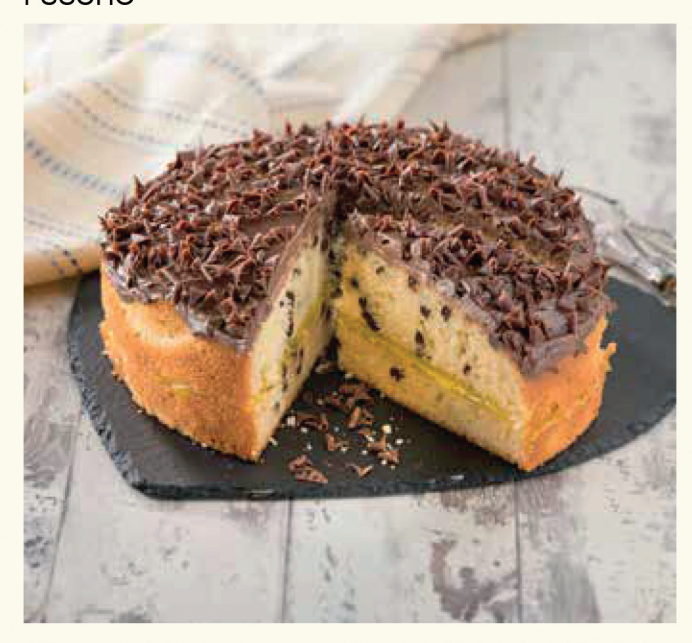
A light sponge infused with orange and scattered with chocolate chips, filled with a rich tangy orange curd, and hand-finished with chocolate fudge icing and milk chocolate curls