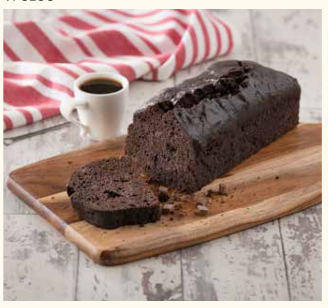
A rich chocolate flavoured sponge loaded with dark chocolate chunks, baked in a loaf tin, perfect for slicing.