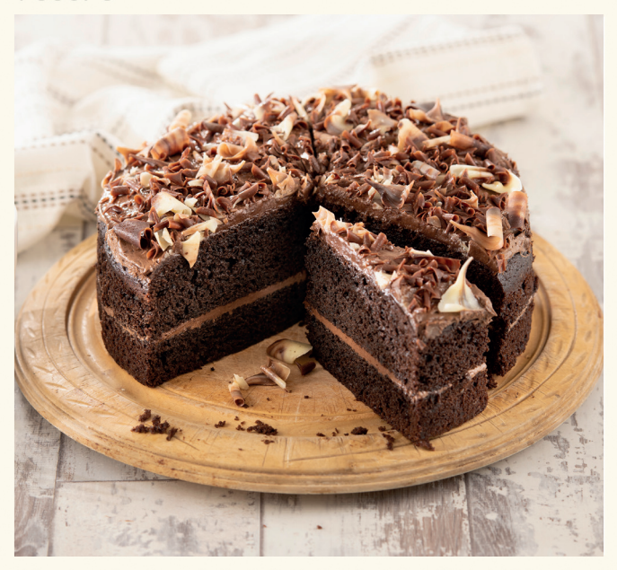
A luxurious chocolate cake loaded with chocolate chips, filled and finished with an indulgent and thich rich chocolate fudge icing, decorated with milk chocolate curls and a light drizzle of white yoghurt icing. Portioned into 12's.