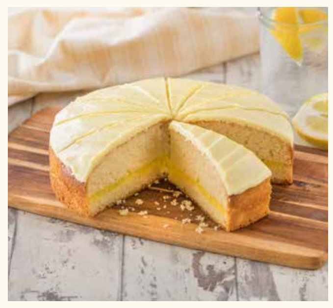
A light lemon flavoured sponge, filled with lemon curd, finished with a zesty lemon flavoured icing