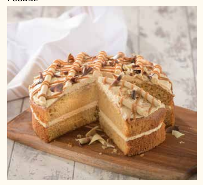
A light toffee flavoured sponge filled and finished with a creamy Dulce de Leche filling, decorated with a drizzle of caramel flavour icing and marbled milk and white chocolate curls.