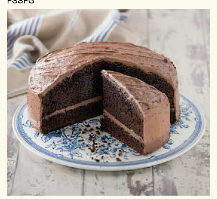
A luxurious chocolate cake, filled and coated with an indulgent and thick chocolate fudge icing.