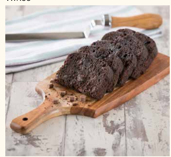
A rich chocolate flavoured sponge loaded with dark chocolate chunks, baked in a loaf tin, sliced and individually wrapped. Perfect for Grab and Go, Eat on the Move