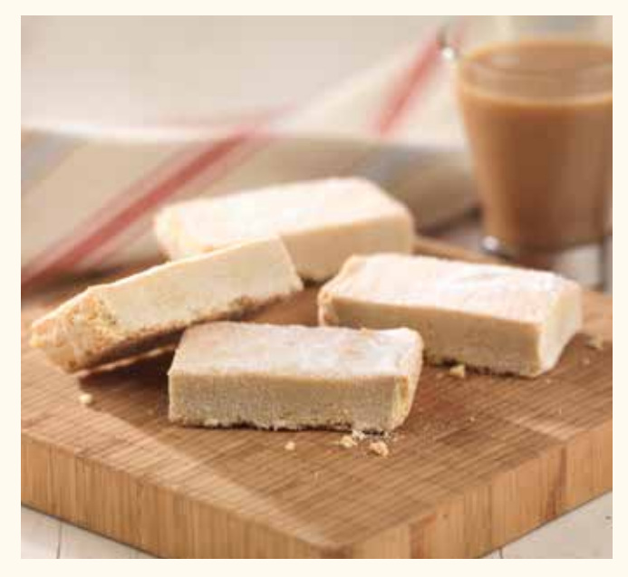
Traditional rich crumbly butter shortbread, cut into 12 rectangles, single tray in sleeve.