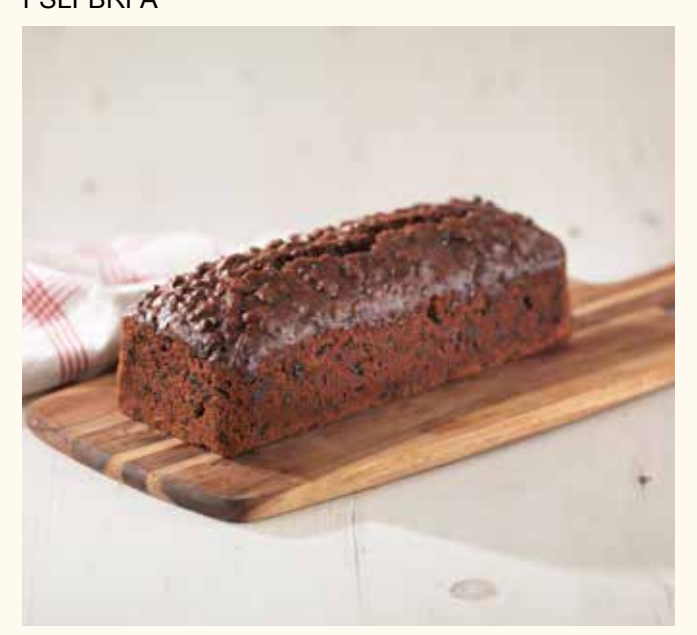
A rich moist sponge flavoured with cinnamon, mixed spice and orange, loaded with juicy plump sultanas, raisins, citrus candied peel and red candied cherries and brandy.