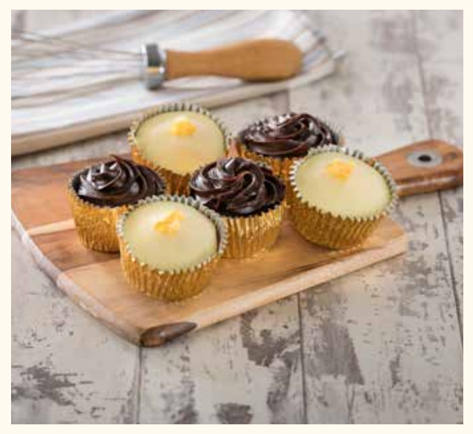
A mixed pack of indulgent Vegan Lemon and Chocolate cupcakes, sold in a pack of 16, 8 per flavour.