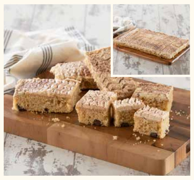
A moist coffee flavoured cake, laced with dark chocolate chunks, finished with a smooth creamy coffee flavoured cream and a fine dusting of cocoa, cut into 12 rectangles, single tray in sleeve